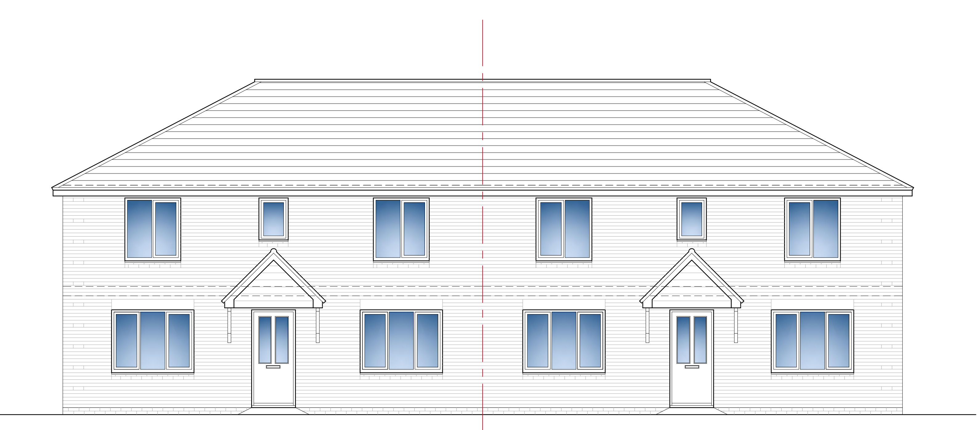
Proposed Front Elevation - Type B - 1:50