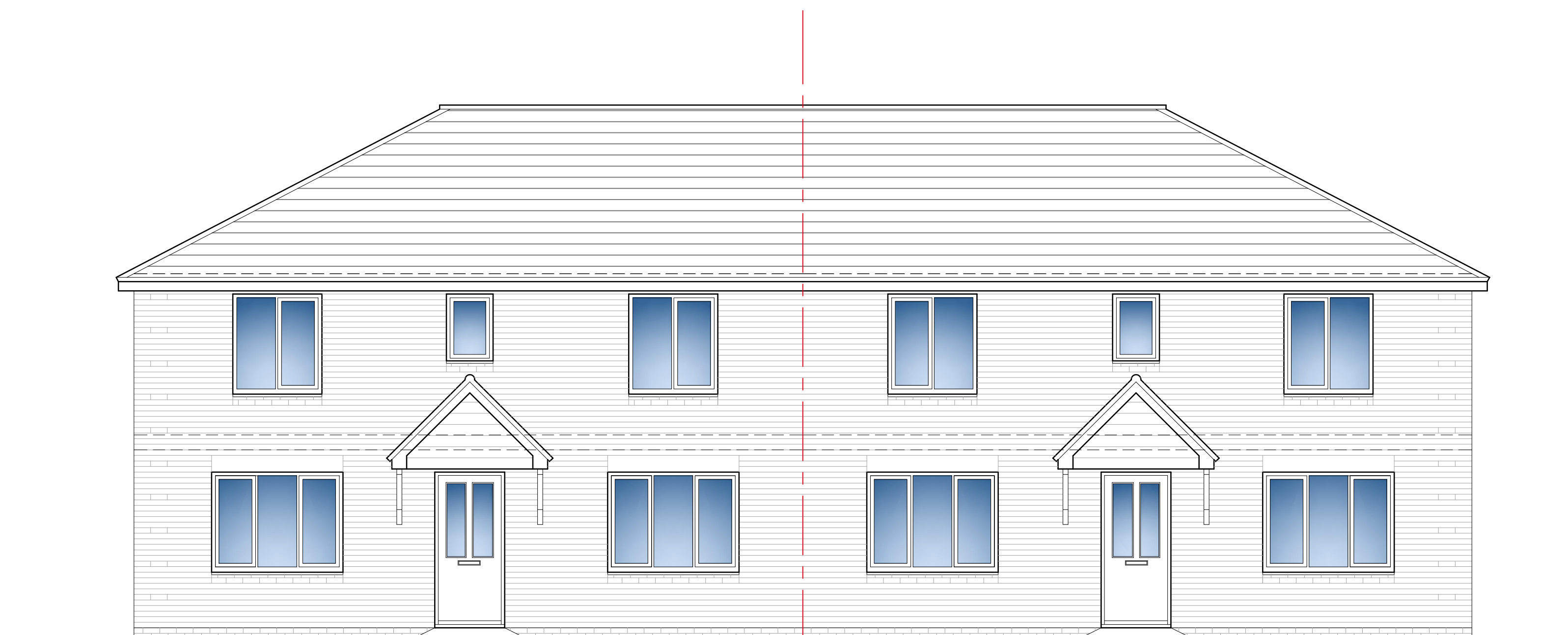
Proposed Front Elevation - Type B - 1:50