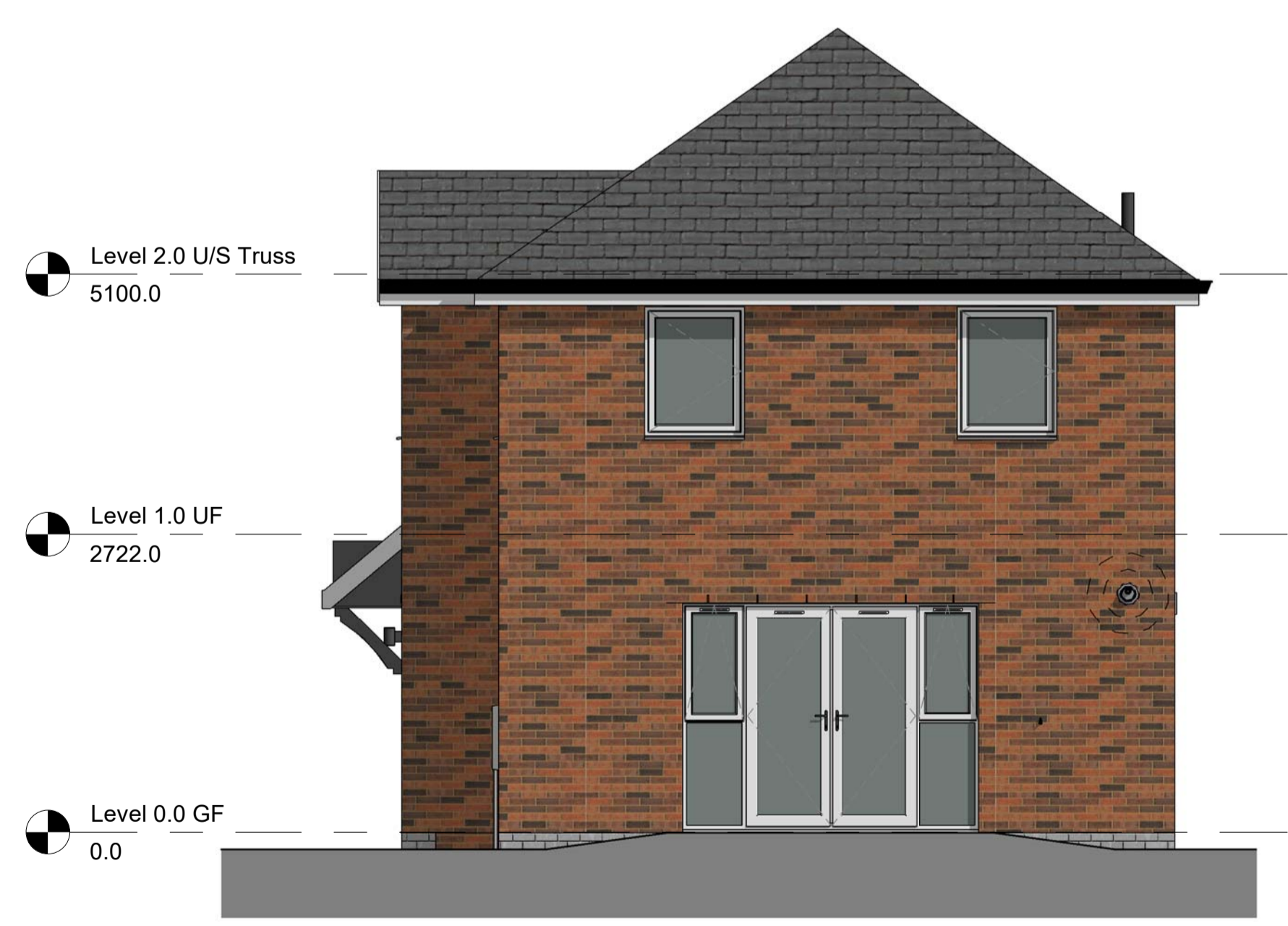
4 1601 - Rear Elevation 1 : 50