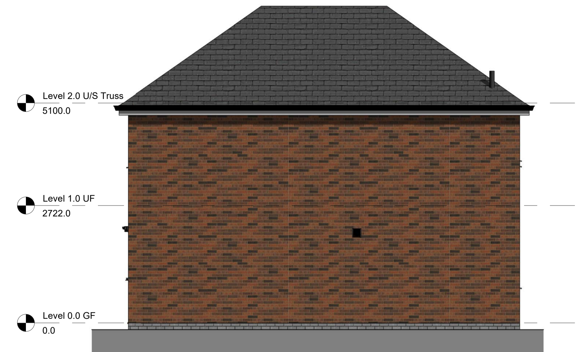
2 1601 - End Elevation 1 : 50