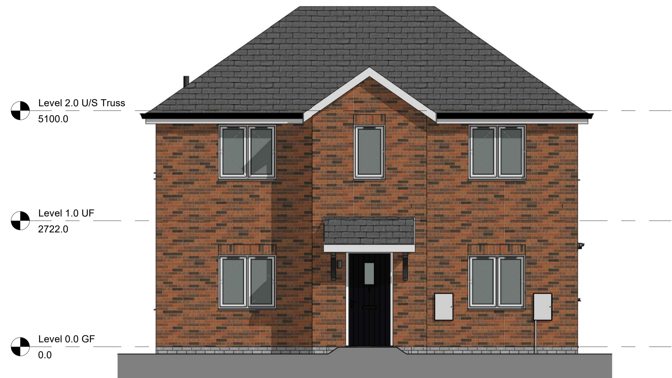
1 1601 - End (Entrance) Elevation 1 : 50