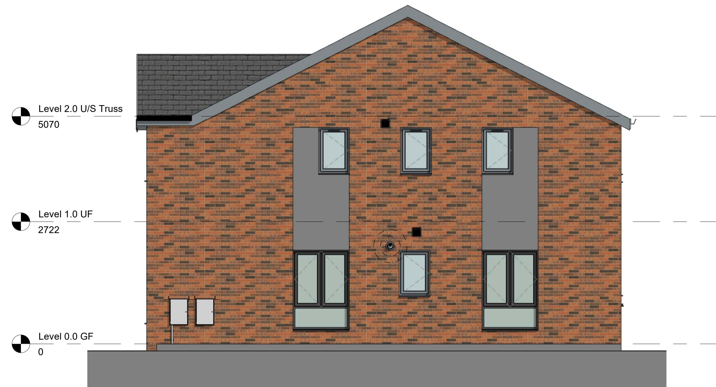
2 1601 - Gable Elevation 1 : 50