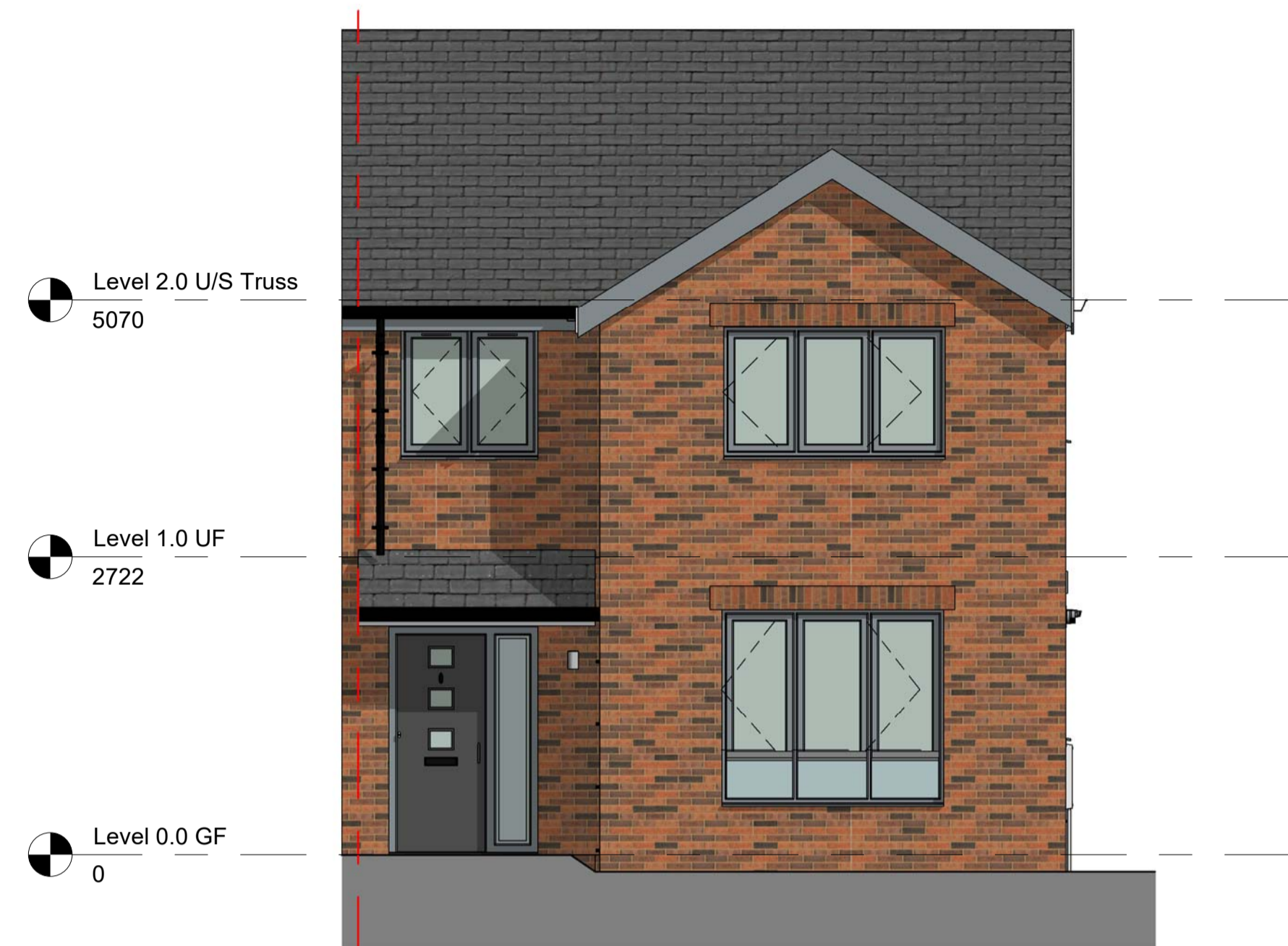
1 1601 - Front Elevation 1 : 50